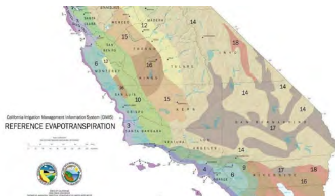
Avg Annual Reference ET by Zone (inches/yr)

The below values were calculated using ET reference averages for zone 10 from the Crop Report (see below figure).