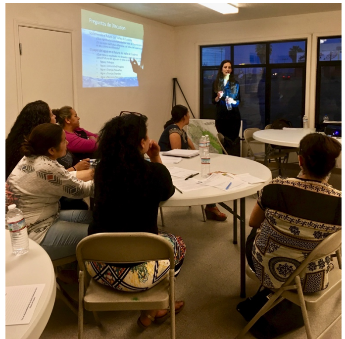
Discussion at the Spanish Language workshop on June 6.

The Plan Area Description is a detailed description of the Cuyama Basin, including major streams and creeks, geologic faults and formations, soil types, groundwater monitoring wells, groundwater production wells, precipitation data, surface water data, land use designations, Cuyama River flows, and groundwater level trends. The Plan Area also describes existing surface water and groundwater monitoring programs, existing water management programs, and land use plans in the Plan Area.